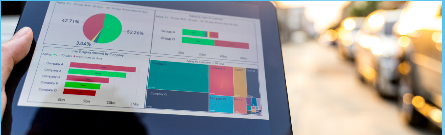
Tableau Springbrook Reporting & Analytics

The most powerful analytics and reporting tool available for local governments.